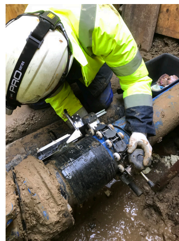
On-site PE pipe joint inspection