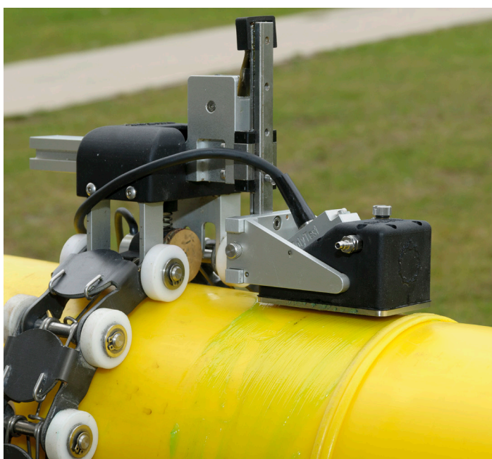
The PolyTest system

AN INNOVATIVE FIELD INSPECTION SYSTEM FOR VOLUMETRIC NON-DESTRUCTIVE TESTING OF ELECTROFUSION AND BUTT FUSION JOINTS IN POLYETHYLENE (PE) PIPES.